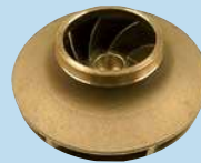
Bronze impeller (on request)

High-flow self-priming pool pump suitable for larger filtration systems and for high-pressure working. Cataphoresis painting, screws in AISI316 and pump body in polypropylene with glass fiber give a remarkable resistance to corrosion. In addition, a large support base make the whole system particularly robust.