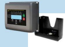
Self-vented wall support